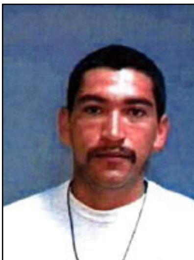
Photograph taken in 1993